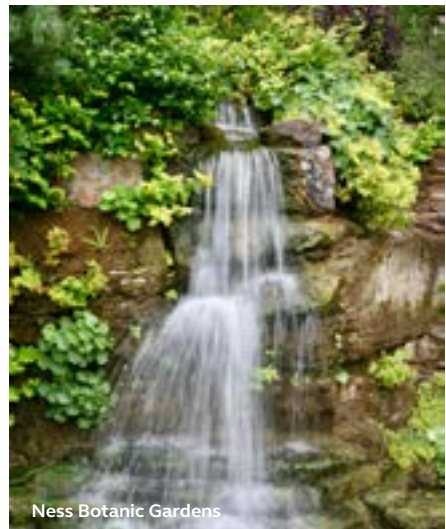
Ness Botanic Gardens