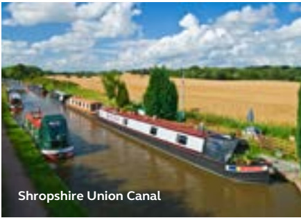
Shropshire Union Canal