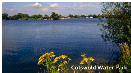
Cotswold Water Park

Watch as the fish are fed and learn about the life of a trout! Catch your own fish in the school holidays with equipment provided.