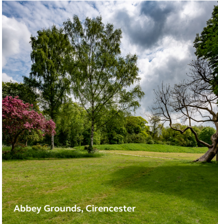
Abbey Grounds, Cirencester