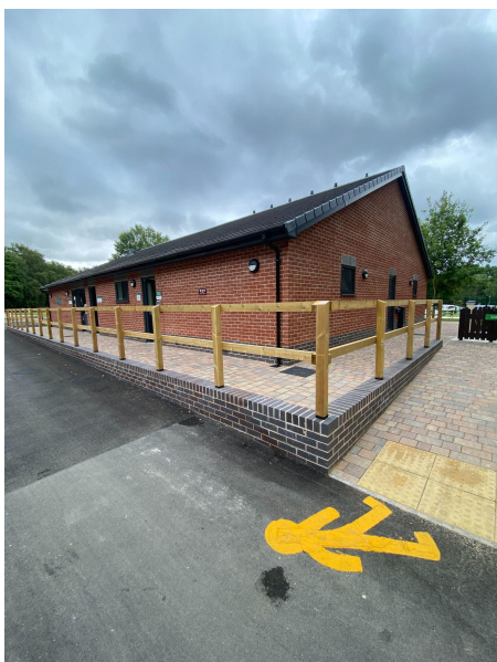
Toilet Block A