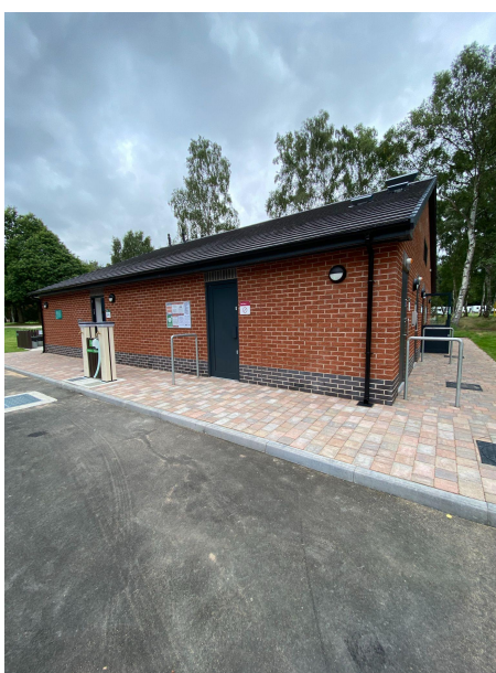
Toilet Block B