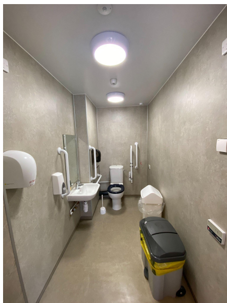
Accessible Toilet Facilities