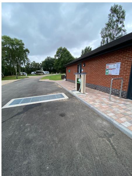
Motorhome Service Point at Toilet Block B