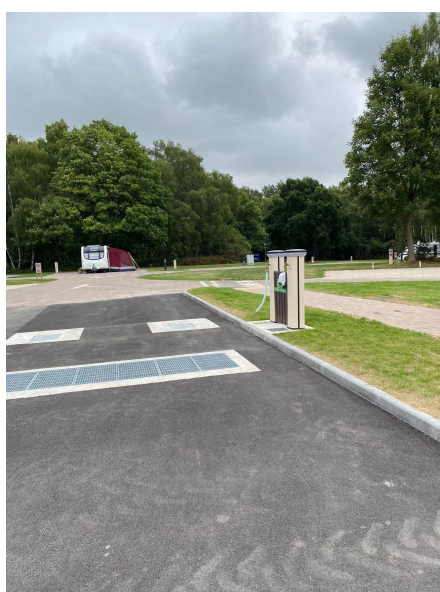
Motorhome Service Point at Toilet Block A