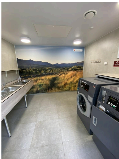
Dishwashing and Laundry Room