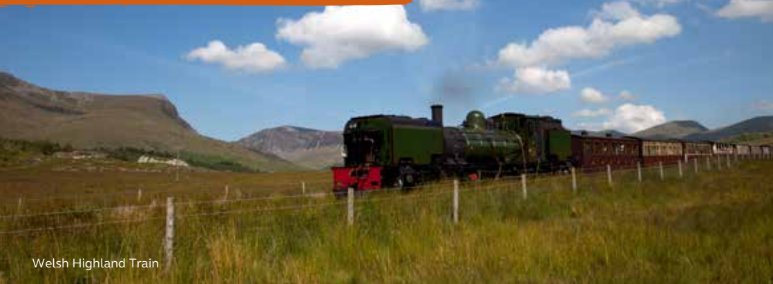
Welsh Highland Train

A great day out is to Morfa Nefyn on the Lleyn peninsula, a fishing port which can only be reached by foot.