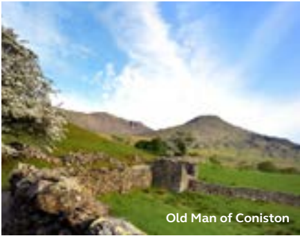
Old Man of Coniston