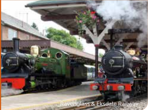
Ravenglass & Eksdale Railway