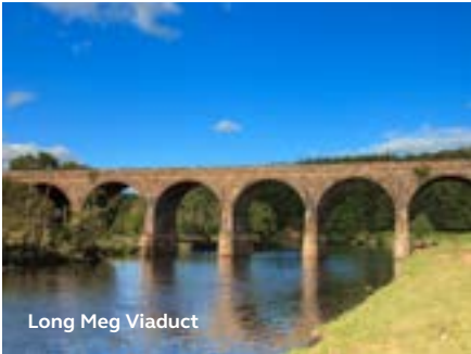
Long Meg Viaduct