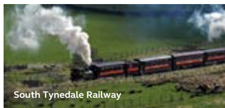
South Tynedale Railway

Don't forget to check your Great Saving Guide for all the latest offers on attractions throughout the UK. camc.com/greatsavingsguide