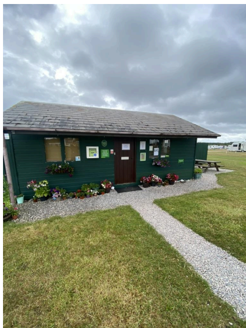
Entrance to Reception