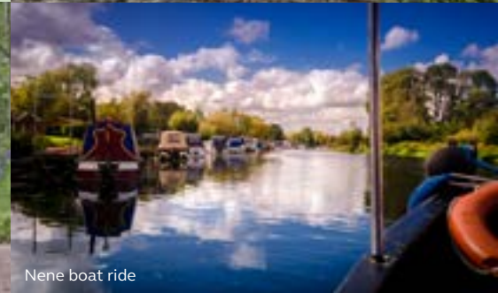
Nene boat ride