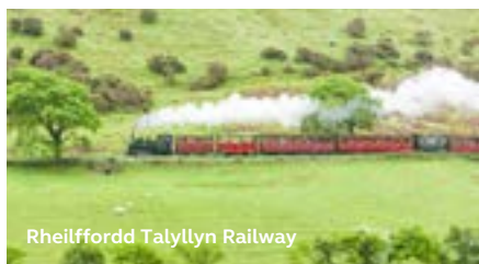
Rheilffordd Talyllyn Railway