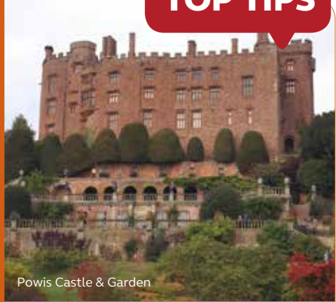
Powis Castle & Garden

Discover the breath-taking Rheidol Valley, home to a magnificent reservoir.