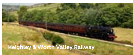
Keighley & Worth Valley Railway

Don't forget to check your Great Saving Guide for all the latest offers on attractions throughout the UK.