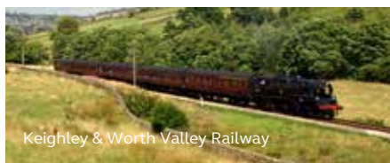
Keighley & Worth Valley Railway

Don't forget to check your Great Saving Guide for all the latest offers on attractions throughout the UK.