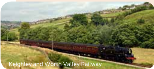
Keighley and Worth Valley Railway