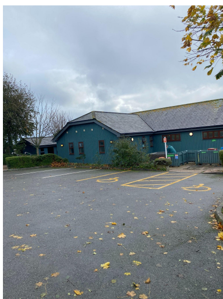
Toilet Block A