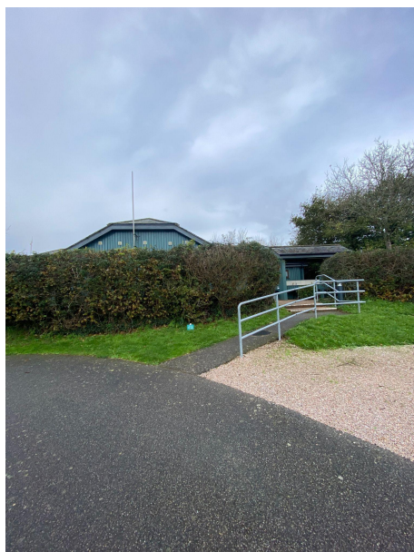
Toilet Block B