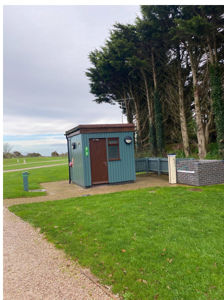
Small Toilet Block - only 2 cubicles