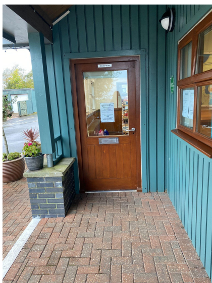
Entrance to reception