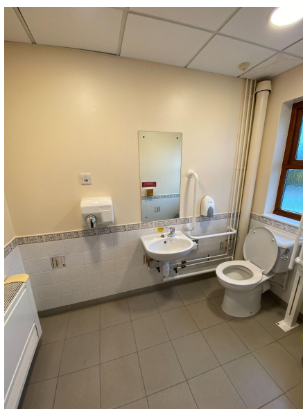
Accessible WC cubicle