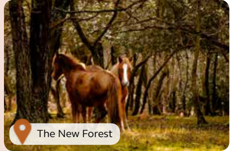
The New Forest

Nestled on the Jurassic Coast, with fantastic views, beaches and attractions.