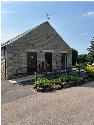
Toilet Block B