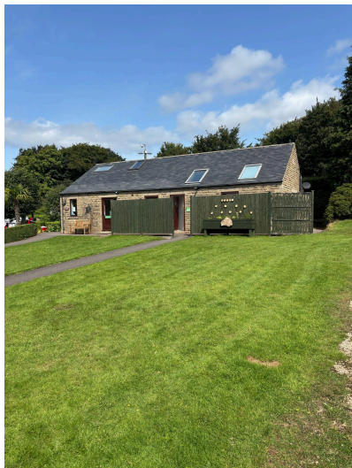
Toilet Block A