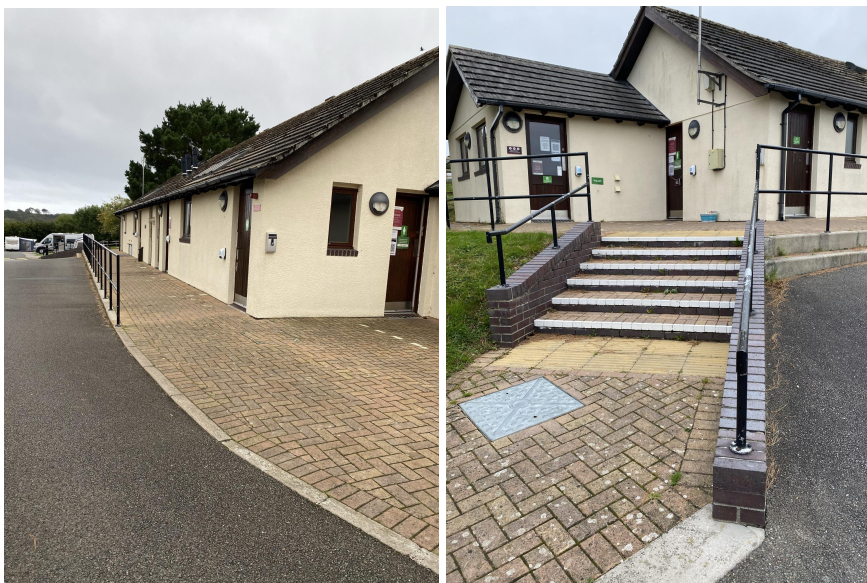
Lower Toilet Block