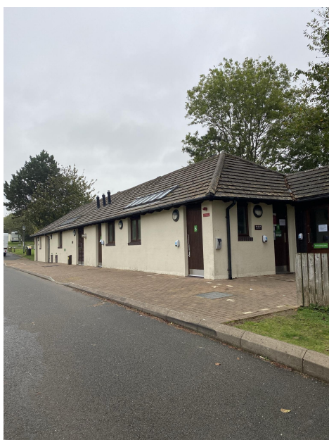
Upper Toilet Block