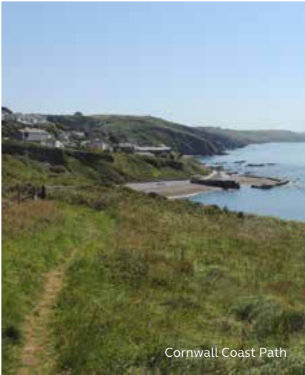
Cornwall Coast Path