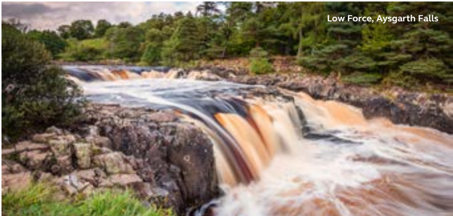
Low Force, Aysgarth Falls

Route 71, part of the Sea-to-Sea trail, is an on-road route that passes through Leyburn.