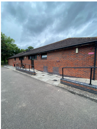
Toilet Block 2