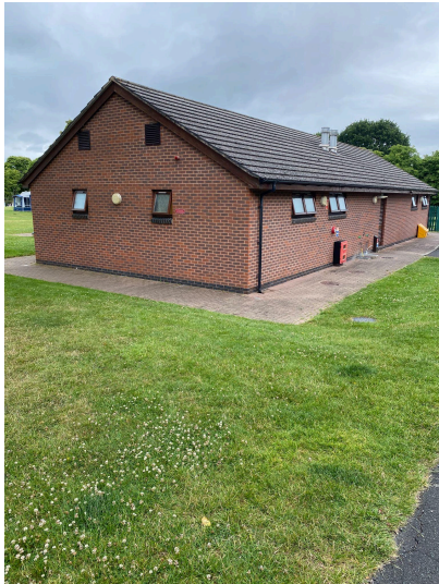
Toilet Block 1