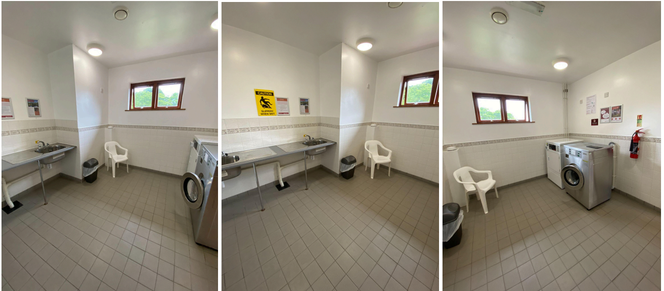
Laundry Room - Toilet Block 1