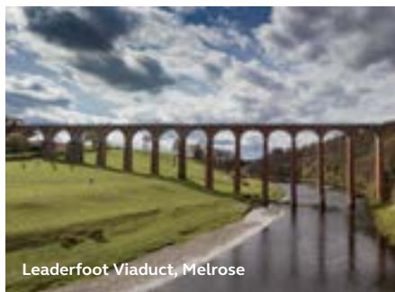
Leaderfoot Viaduct, Melrose