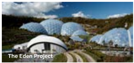
The Eden Project

Don't forget to check your Great Saving Guide for all the latest offers on attractions throughout the UK. camc.com/greatsavingsguide