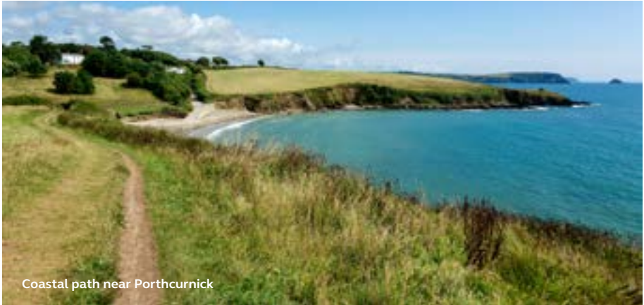
Coastal path near Porthcurnick

Enjoy walking along the coastal footpaths and beaches; from site, follow the stunning path to St Anthony Head. For a range of walking routes on the peninsula visit www.falriver.co.uk/walks .