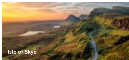
Isle of Skye

Don't forget to check your Great Saving Guide for all the latest offers on attractions throughout the UK. camc.com/greatsavingsguide