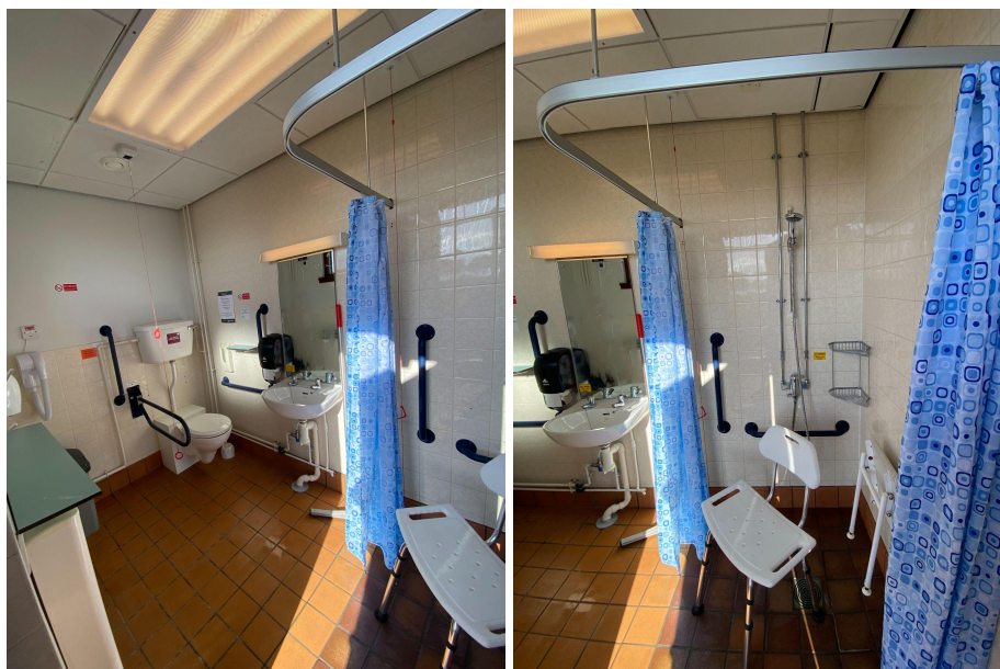
Accessible Toilet and Shower - Toilet Block A