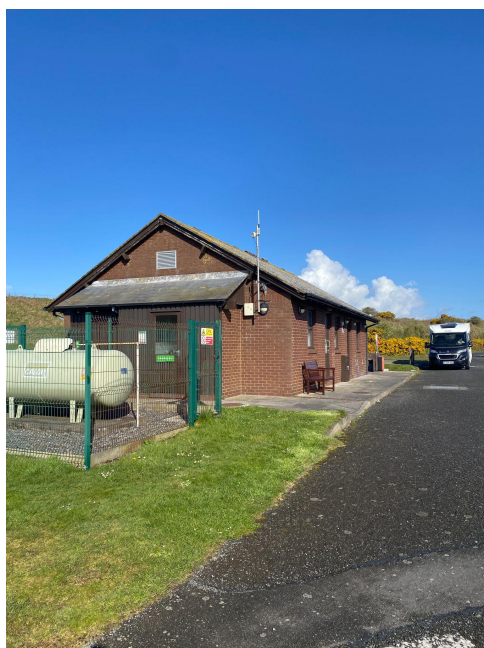
Toilet Block B