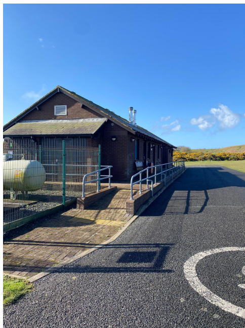
Toilet Block A