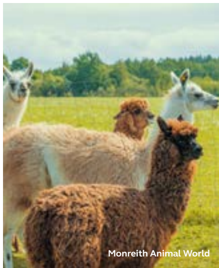
Monreith Animal World