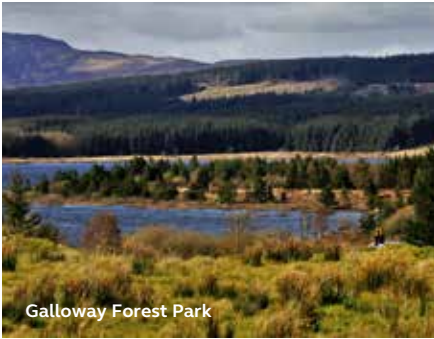
Galloway Forest Park