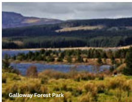
Galloway Forest Park