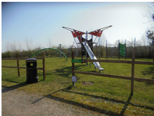
Play Area near reception