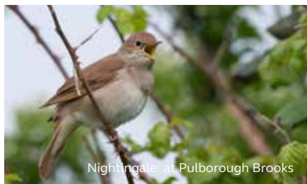
Nightingale at Pulborough Brooks

Don't forget to check your Great Saving Guide for all the latest offers on attractions throughout the UK.