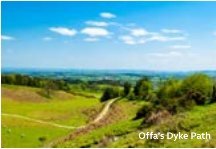
Offa's Dyke Path