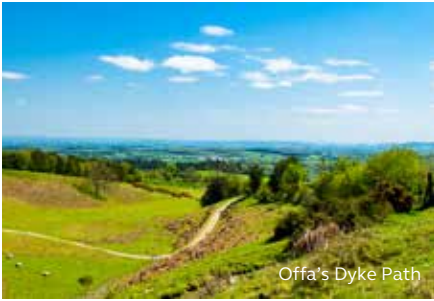
Offa's Dyke Path