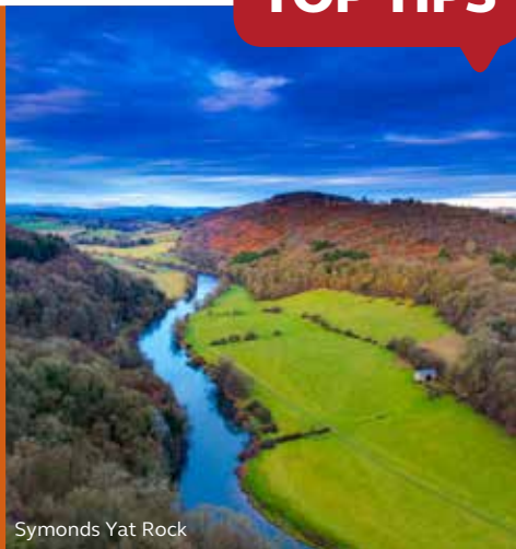
Symonds Yat Rock

Definitely visit Wilton Castle in Ross-on-Wye, it's beautiful and is great for photos.