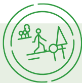
Offa's Dyke Walk