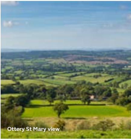
Ottery St Mary view