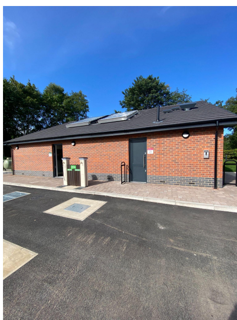
Toilet Block B