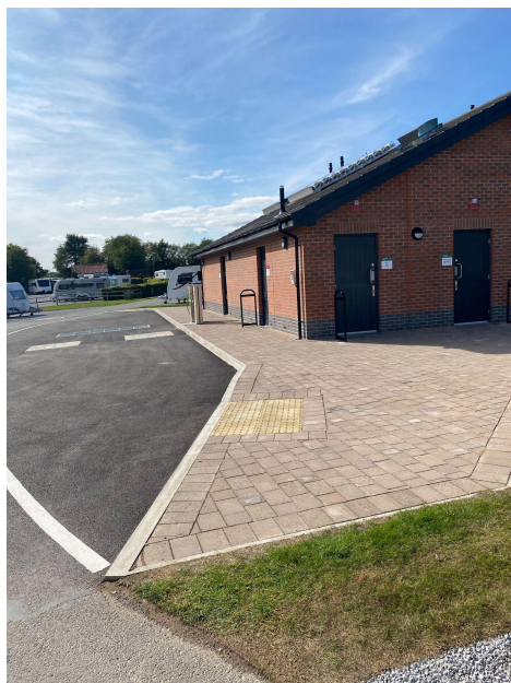
Toilet Block A