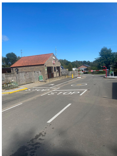
Entrance to Reception