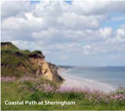
Coastal Path at Sheringham