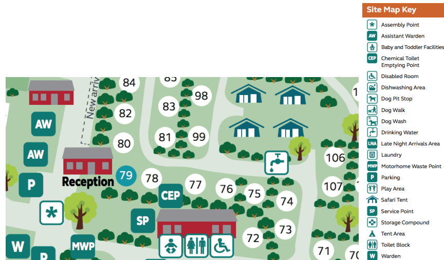
Layout of the Safari Tents on site