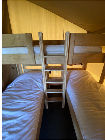
The single beds in one of the rooms in the tent