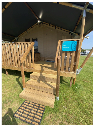
Stepped access up to the Safari Tents only