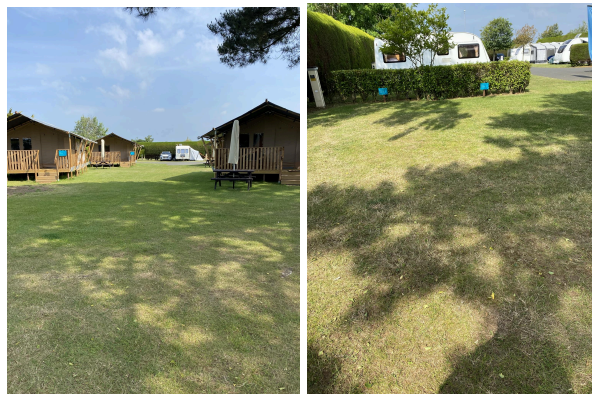
Layout of the Safari Tent Field and two of the parking spaces