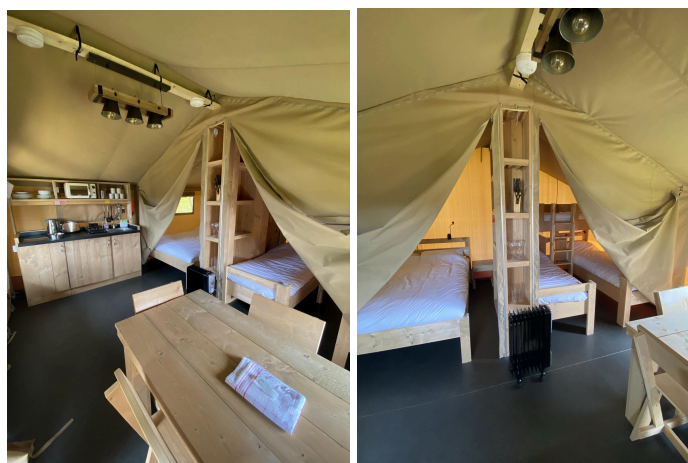
The tents' layout of the different rooms