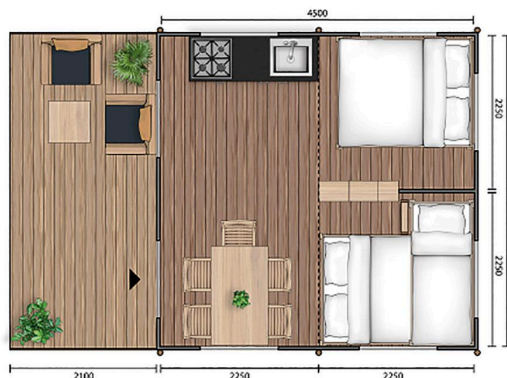
Floorplan of the Safari Tents, however there are single beds underneath the raised bunk in the tents on site