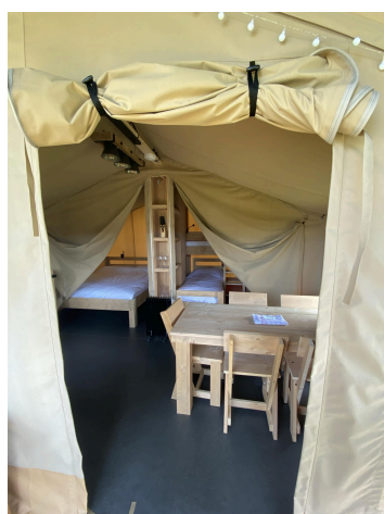
The entrance to the Tent is through a roll-up door