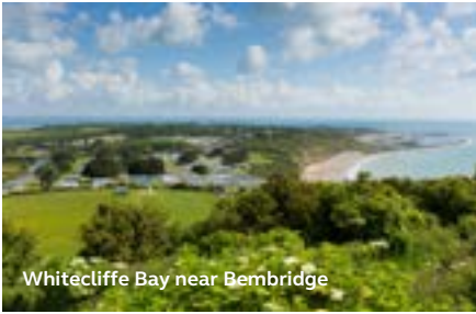
Whitecliffe Bay near Bembridge