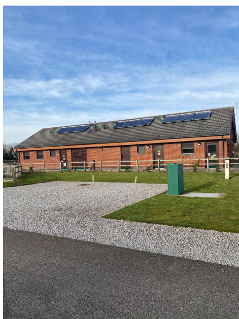
Toilet Block B