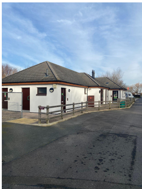
Toilet Block A