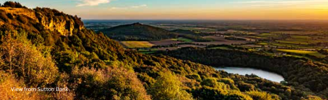
View from Sutton Bank

The Town Museum (free entry) and the World of James Herriot Museum in Thirsk are both interesting visits.