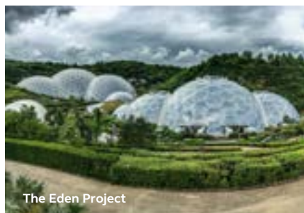
The Eden Project

Based on the beach throughout the summer; a fun way to learn how to take to the waves.