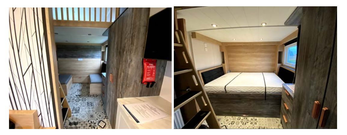
There is a dining area at the back, which pulls down into a bed.