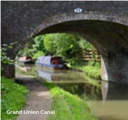
Grand Union Canal