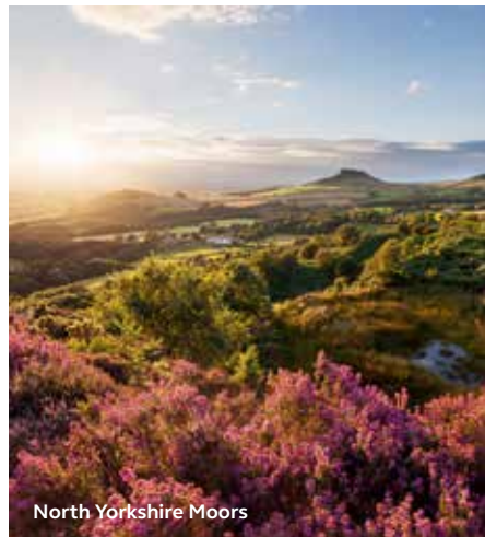
North Yorkshire Moors

Seaside resort home to the worlds oldest surviving lifeboat.