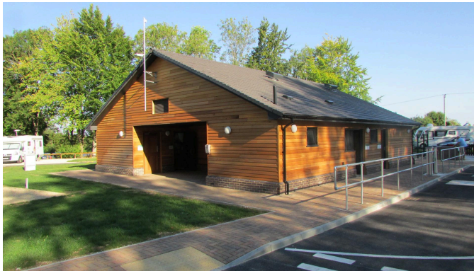
Lower Toilet Block