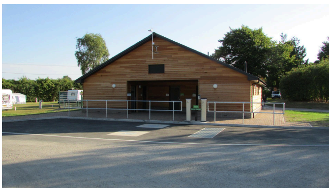
Upper Toilet Block