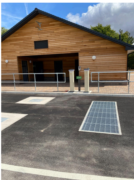
Motorhome Service Point by Upper Toilet Block