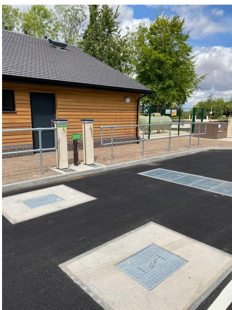
Motorhome Service Point by Lower Toilet Block