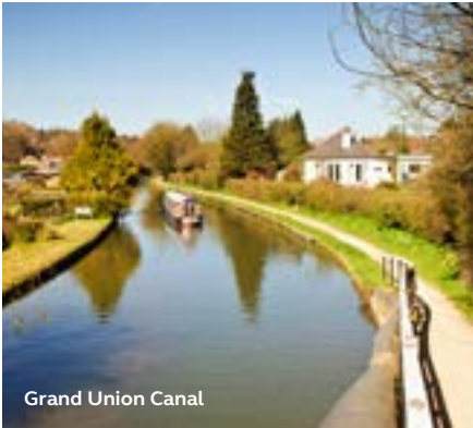
Grand Union Canal