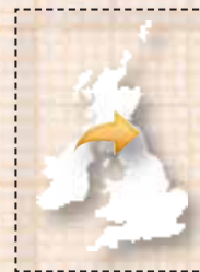
Ordnance Survey Landranger Map 75

6 Immediately having passed beneath the railway arch, look for a metal gate beside a public footpath sign on your right. This gate might be locked, but you have permission to climb over it (see the sign). Once over the gate, turn immediately left to proceed along the left-hand side of the field. Cross through the left corner, by some staggered gates, and descend sharply for a short