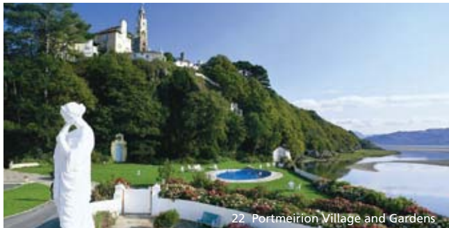
22 Portmeirion Village and Gardens