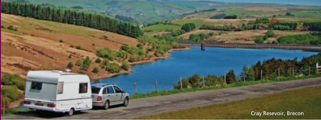
Cray Reservoir, Brecon

With hundreds of castles and a language, mythology and folklore of its own, Cymru is a country like no other. You'll no doubt wish to explore Snowdonia and Brecon Beacons National Parks, but don't neglect the wonderful coast by St. David's, Britain's smallest city or quaint and pretty Tenby.