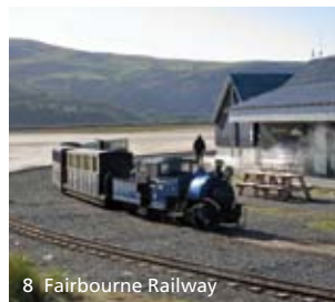
8 Fairbourne Railway