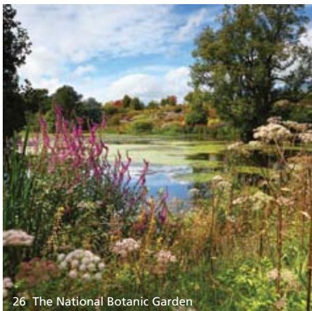
26 The National Botanic Garden

www.welsh-hawking.co.uk 01446 734687 Weycock Road, Barry, Vale of Glamorgan CF62 3AA We have 200 birds of prey, including eagles, owls, hawks, falcons and buzzards. For the young we have rabbits, chickens, ducks etc. Flying displays at 12.00 and 14.30hrs. Two for the price of one.