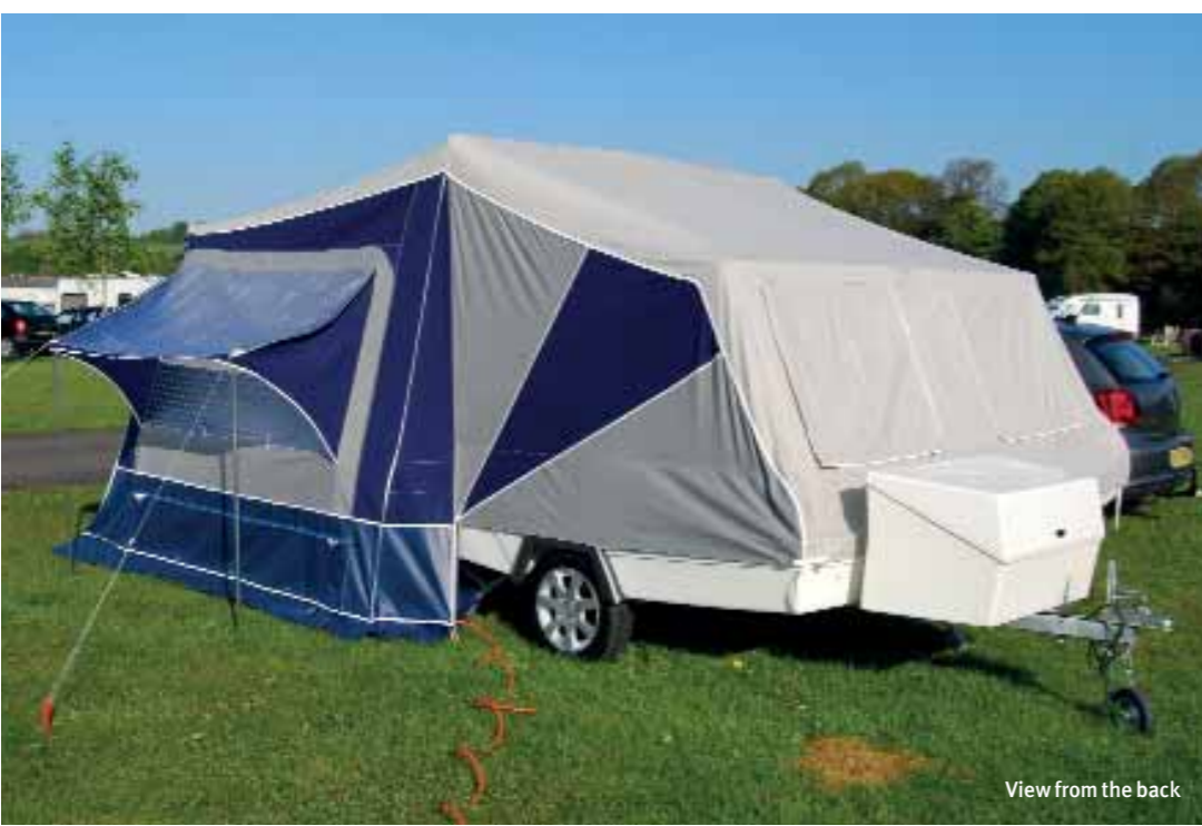
View from the back