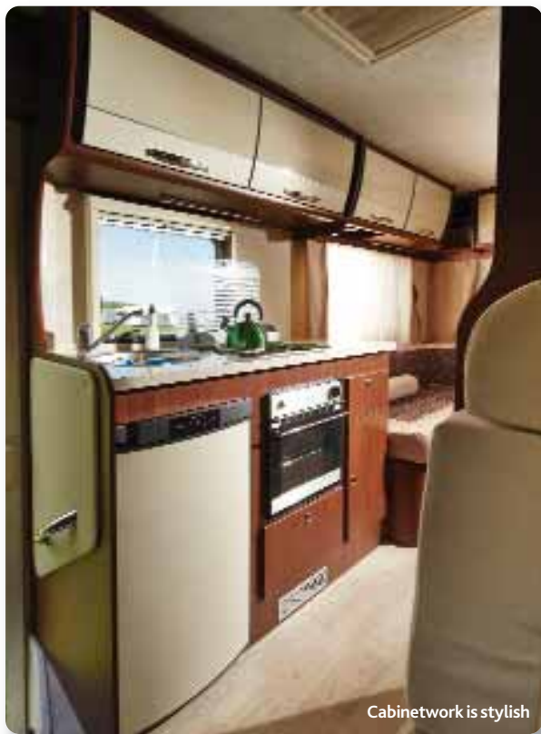
Cabinetwork is stylish