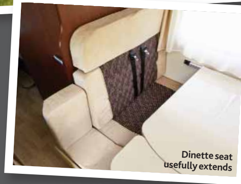
Dinette seat usefully extends