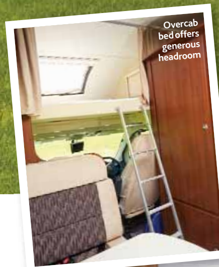
Overcab bed offers generous headroom

Although one rear roof locker is devoted to a drop-down TV bracket, one remains for each occupant plus a couple of >>