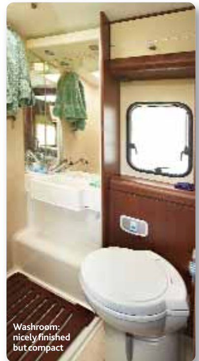
Washroom: nicely finished but compact