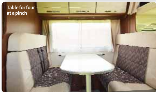
Table for four – at a pinch

The giant Skyline front sunroof is an unexpected feature and one of three opening windows in the Luton. Excellent lighting is by LEDs throughout.