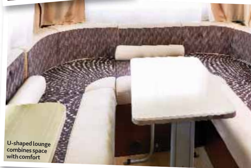
U-shaped lounge combines space with comfort

Auto-Roller comes with a 10-year body warranty