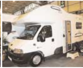
FAR LEFT: Lunar Roadstar's new look: this is the 786 LEFT: Lunar Champ A521