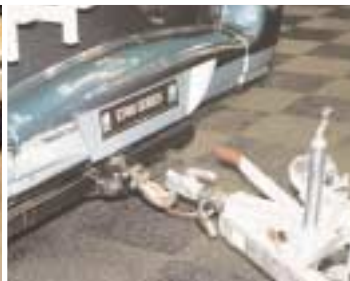
FAR LEFT: Auto-Sleepers' new VW T5 Trooper LEFT: Homologated towbar for Swift/AMC Al-Ko based motorhomes