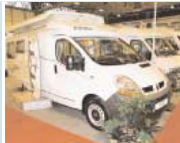
RIGHT: Style by name, Style by Eriba FAR RIGHT: This neat Dutch scooter carrier comes from Nova Leisure, a ramp stowing under the deck