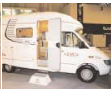
FAR LEFT: A pair of Dreamfinders LEFT: Geist Phantom shown in German LMC livery