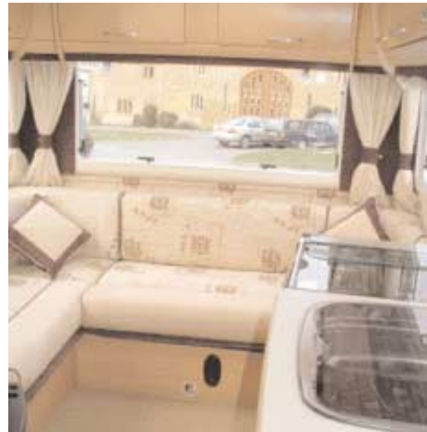
ABOVE: Auto-Sleeper Inca LE's interior ABOVE RIGHT: The Inca exterior

MCC Reimo of Manchester launched its new Cityvan as well as the Legacy, with either elevating roof or high top. With its super-flat elevating roof, the Cityvan can access many car parks while keeping a feeling of spaciousness overnight. Inside, it features slimline units incorporating a single-burner cartridge stove and small sink, as well as luxury velour linings with a choice of different interiors and finishes, and seats up to eight.